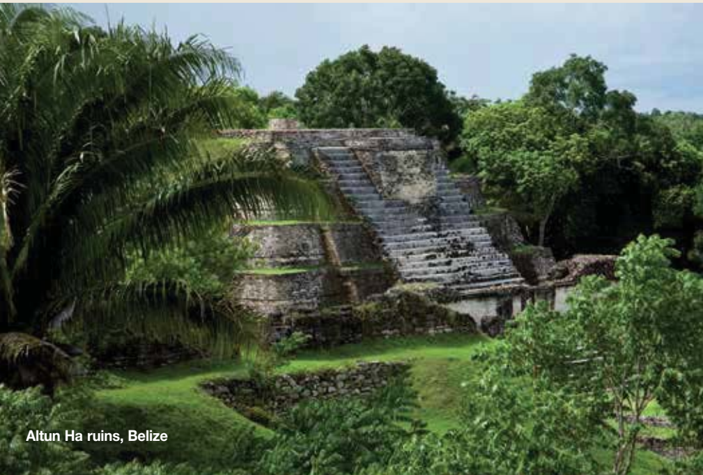
Altun Ha ruins, Belize

All stateroom/suite locations and prices are subject to availability. Deposit and cancellation policies for categories OS, VS, and OC differ from those listed in this brochure. Please call for details.