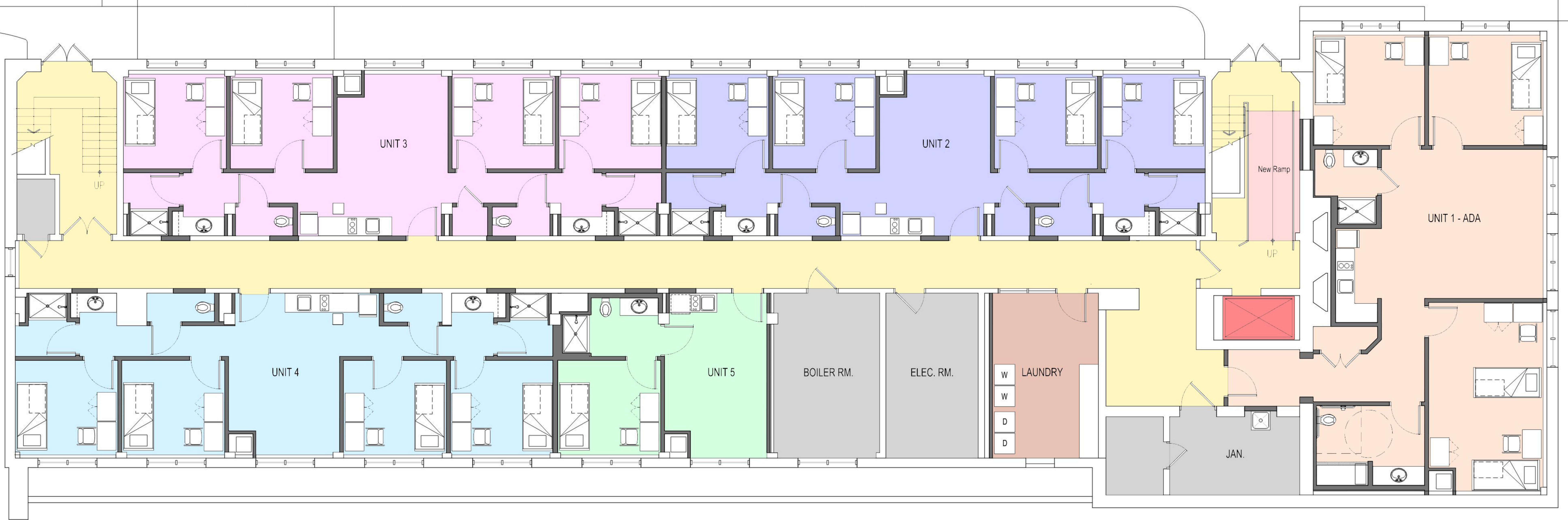
Proposed Lower Level of Prentis Hall 17 Beds in 4 - 4 Bed Suites + 1 - 1 Bed Suite