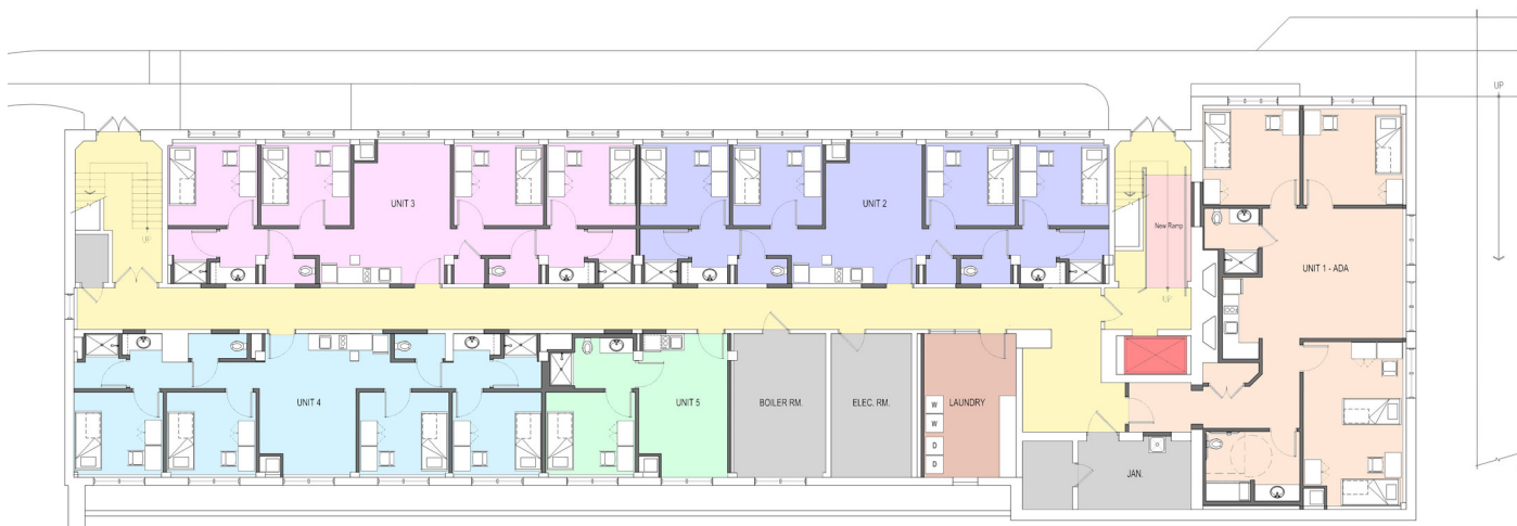
Proposed Lower Level of Prentis Hall 17 Beds in 4 - 4 Bed Suites + 1 - 1 Bed Suite