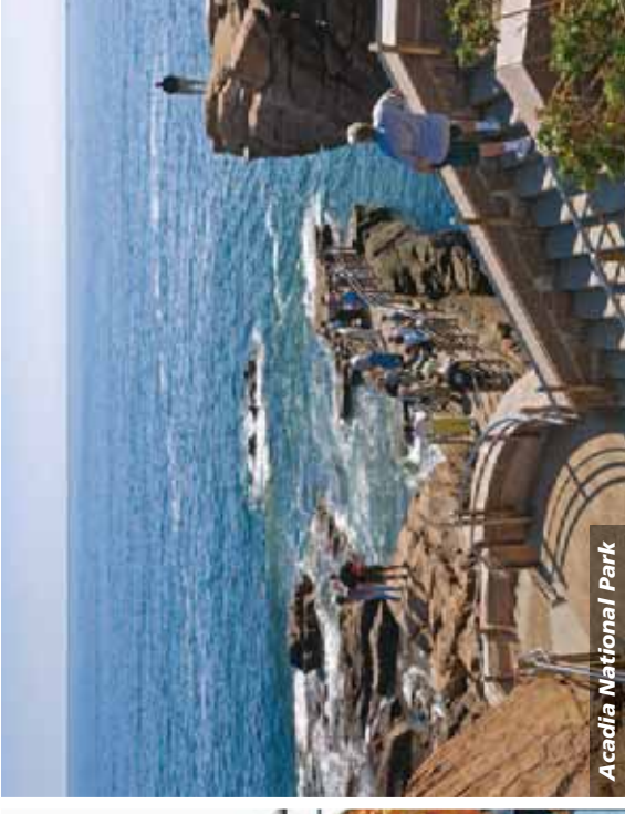
Acadia National Park