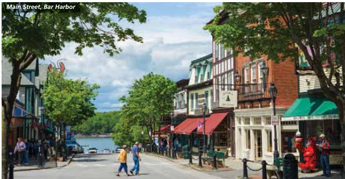
Main Street, Bar Harbor