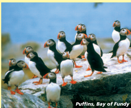
Puffins, Bay of Fundy

Excursion and Educational Focus: The Beloved Island. Discover why Roosevelt called Campobello his "beloved island" during a presentation at the island's library and museum by a local historian. FDR was a member of the library's board. Tour the island, and visit scenic spots, including the island's wharves frequented by FDR and his contemporaries.