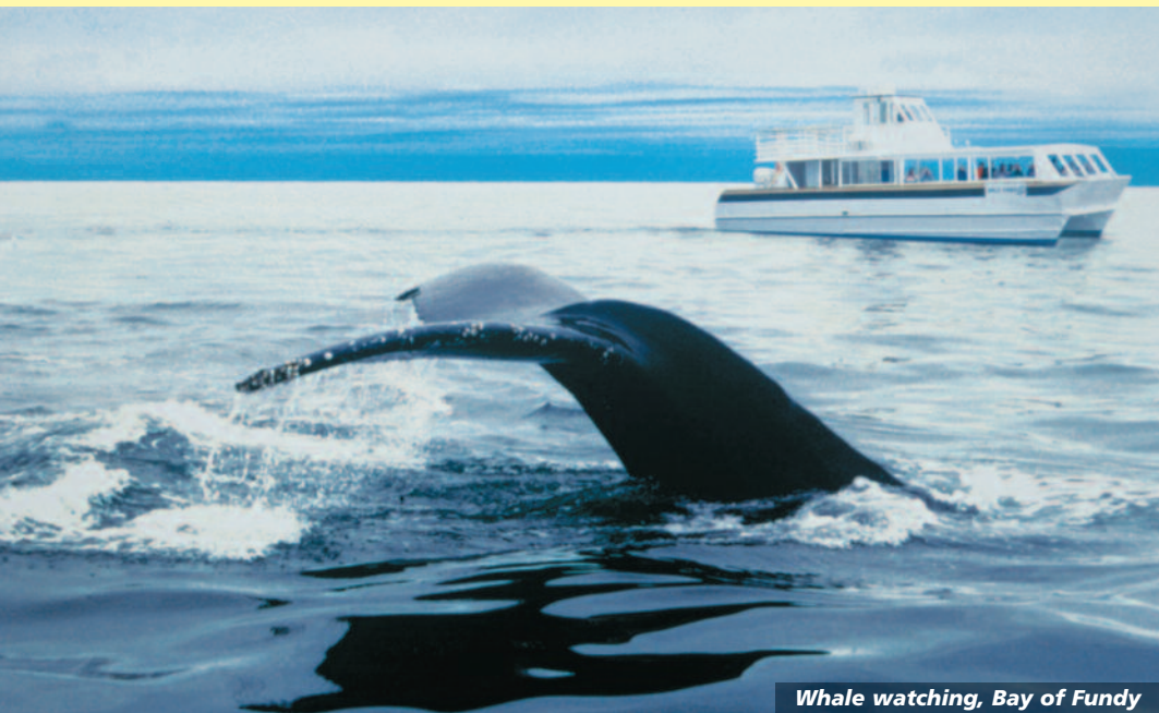
Whale watching, Bay of Fundy