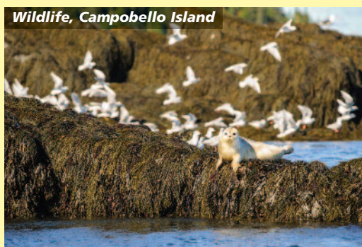
Wildlife, Campobello Island

into Canada to reach Campobello Island, where you will check in to your cottage.