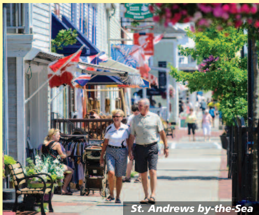
St. Andrews by-the-Sea

Excursion: Go East. Your journey to St. Andrews by-the-Sea takes you briefly back into Maine. Visit Quoddy Head State Park and the easternmost point in the United States. See the distinctive red-and-white striped lighthouse, West Quoddy Head Light. The park is an excellent place to see a variety of birds, and look offshore for a possible sighting of humpback, minke and finback whales. Continue to St. Croix Island International Historic Site. In 1604, a group of French explorers, including Samuel Champlain, landed here and built one of the earliest European colonies in North America. Cross back into Canada, and continue to St. Andrews by-the-Sea, where you will check in to The Algonquin Resort.