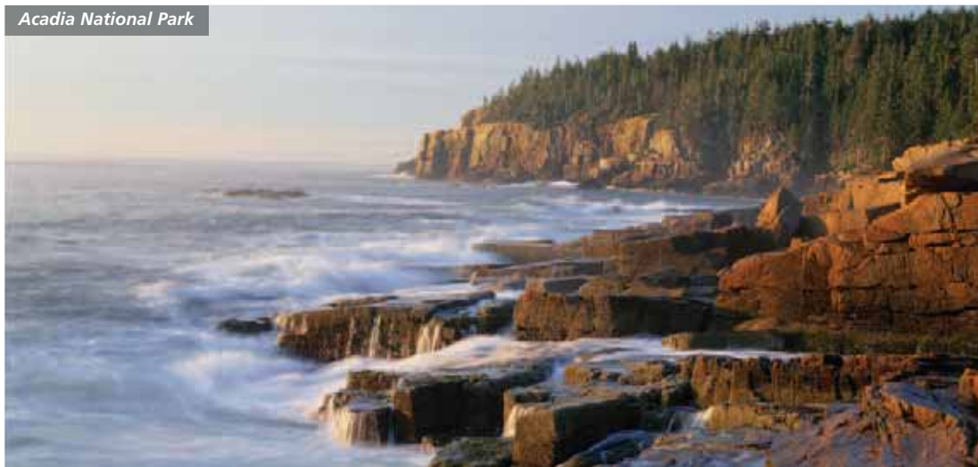
Acadia National Park