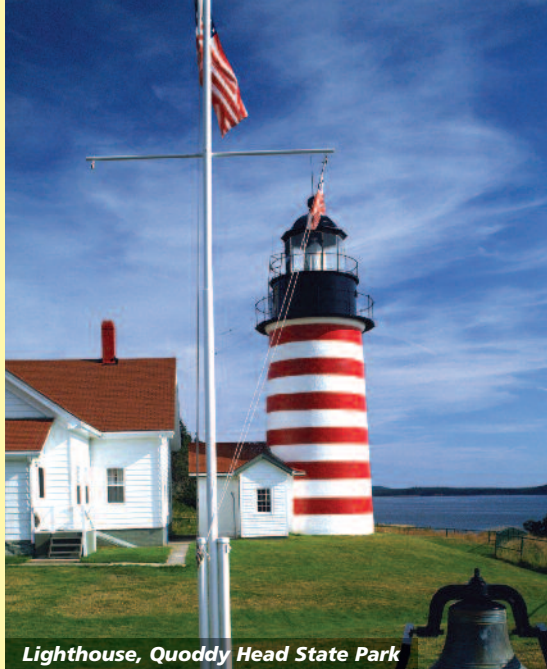
Lighthouse, Quoddy Head State Park