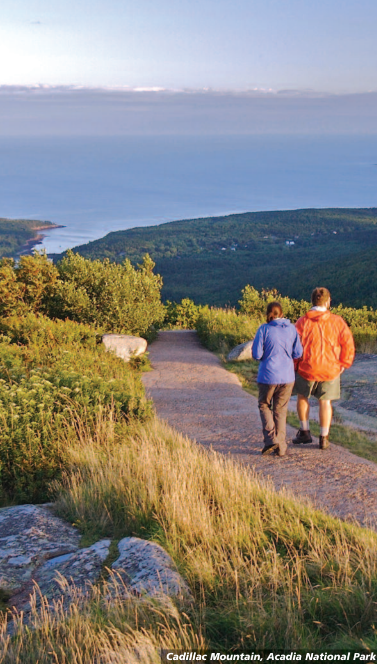
Cadillac Mountain, Acadia National Park

Discover the rustic glamour of Bar Harbor, Campobello Island and St. Andrews by-the-Sea. Favored at the turn of the 20th century by rich and powerful U.S. and Canadian families seeking a change from hectic city life, these remote summer seaside retreats offered fresh air, pristine scenery and rugged outdoor pursuits like sailing and hiking. Today, these locales still remain ideal for a summer getaway, proving that the simple things in life — fresh air, the great outdoors, lobster and fish just plucked from the sea and croquet on the lawn — are often the best.